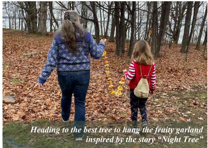
Heading to the best tree to hang the fruity garland inspired by the story "Night Tree"