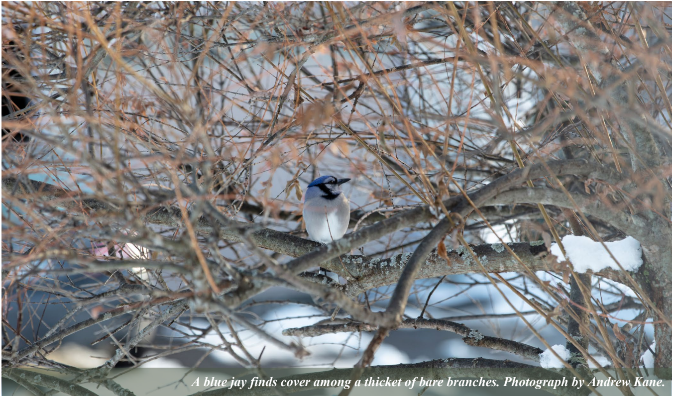
A blue jay finds cover among a thicket of bare branches.

We have been blessed with a mild winter so far. One can hope for a nice balance of soft, fluffy snow for snowshoeing and skiing, and the hint of an early spring as our days will soon become longer. During our winter months, the River has a chance to rest and rebalance. I find the peace and solitude on the River this time of the year very healing. One of my favorite sounds is the pine trees gently whistling in the winter winds. I often stand on my porch just to listen and see if I can hear nature's whispers. I appreciate that all elements of nature need to have an opportunity to rest and rejuvenate to prepare for the changing season.