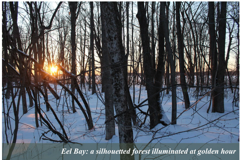
Eel Bay: a silhouetted forest illuminated at golden hour