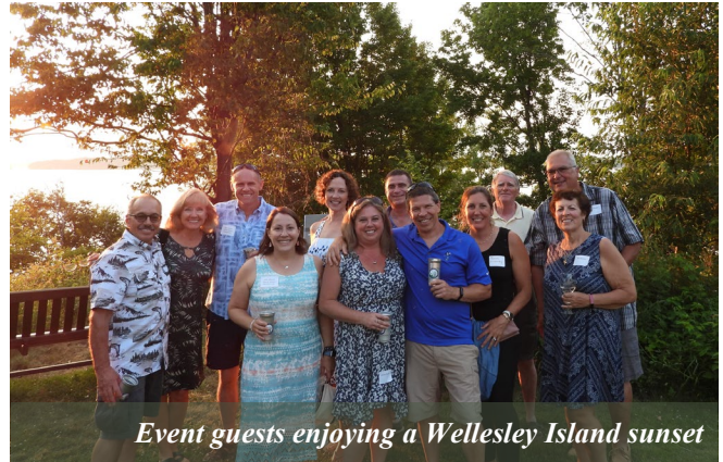
Event guests enjoying a Wellesley Island sunset