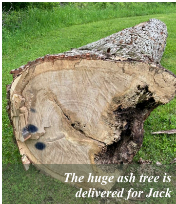
The huge ash tree is delivered for Jack