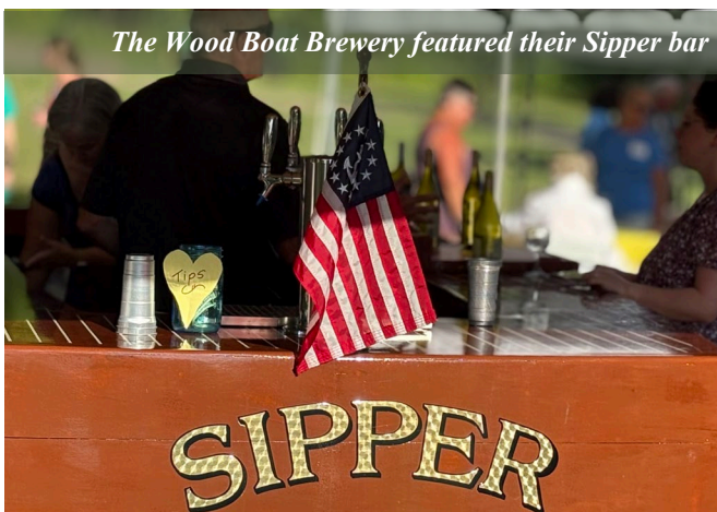
The Wood Boat Brewery featured their Sipper bar