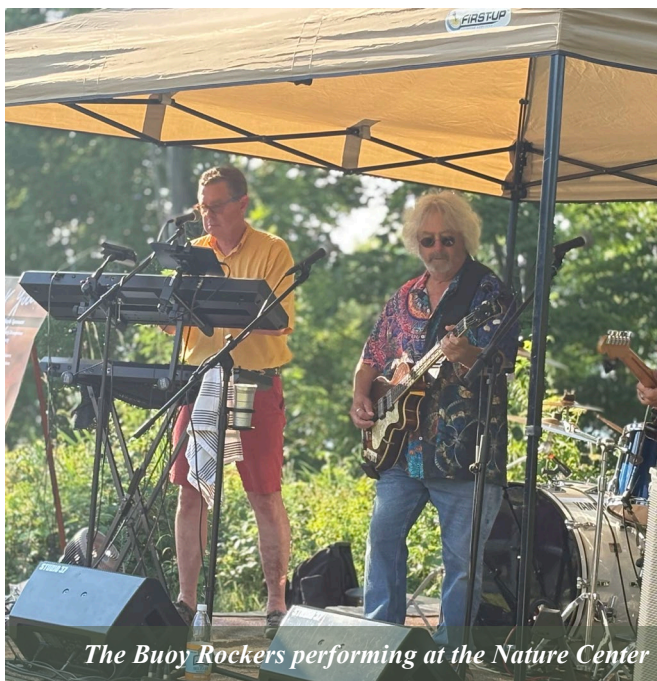
The Buoy Rockers performing at the Nature Center