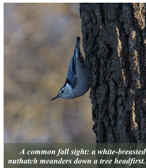
A common fall sight: a white-breasted nuthatch meanders down a tree headfirst.