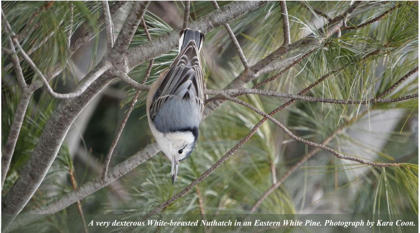
A very dexterous White-breasted Nuthatch in an Eastern White Pine.

We enjoyed a lovely summer at the Nature Center and along the St. Lawrence River this year. The weather was very warm and we had many visitors. Unfortunately, the lack of rain created extremely dry conditions and the grasses and wildflowers were affected by lack of moisture. However, many did not complain as it allowed for lots of sun-filled, fun-filled days in our area.