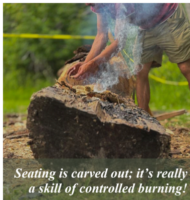
Seating is carved out; it's really a skill of controlled burning!