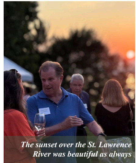
The sunset over the St. Lawrence River was beautiful as always