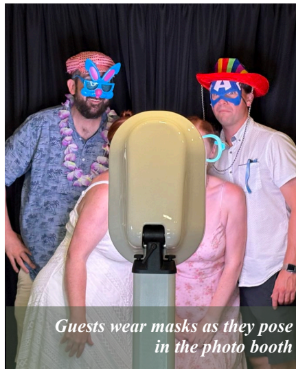
Guests wear masks as they pose in the photo booth