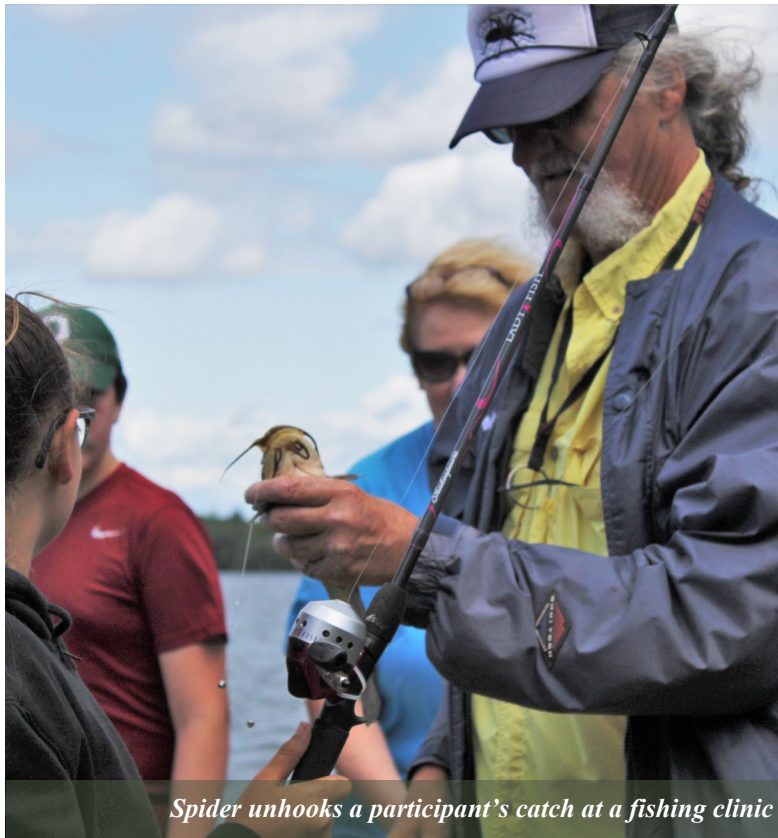
Spider unhooks a participant's catch at a fishing clinic