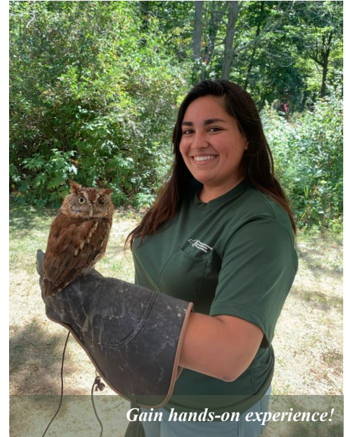
Gain hands-on experience!