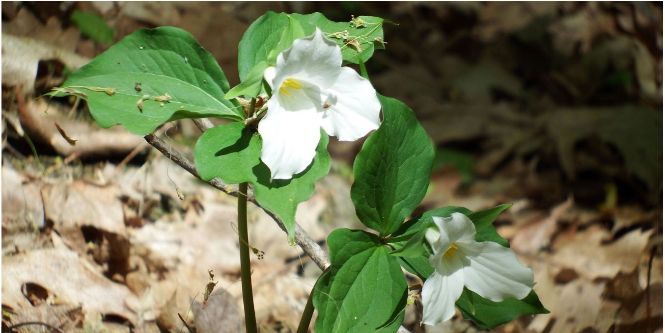
A blooming trillium wildflower signals spring on our trails.