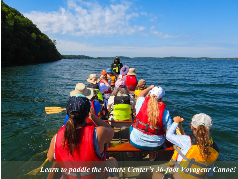
Learn to paddle the Nature Center's 36-foot Voyageur Canoe!