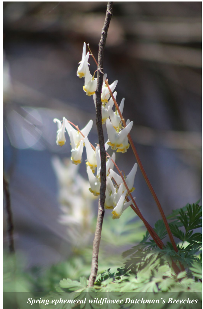
Spring ephemeral wildflower Dutchman's Breeches