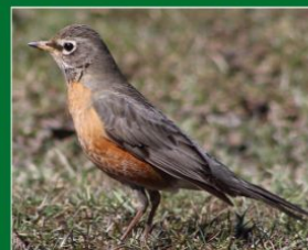
Female American Robin