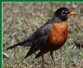
Male American Robin